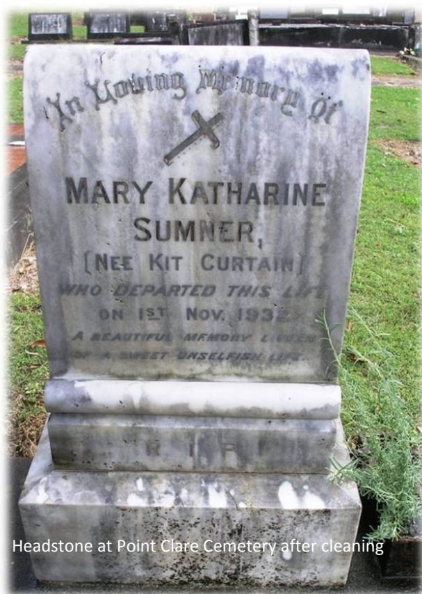
Headstone at Point Clare Cemetery after cleaning